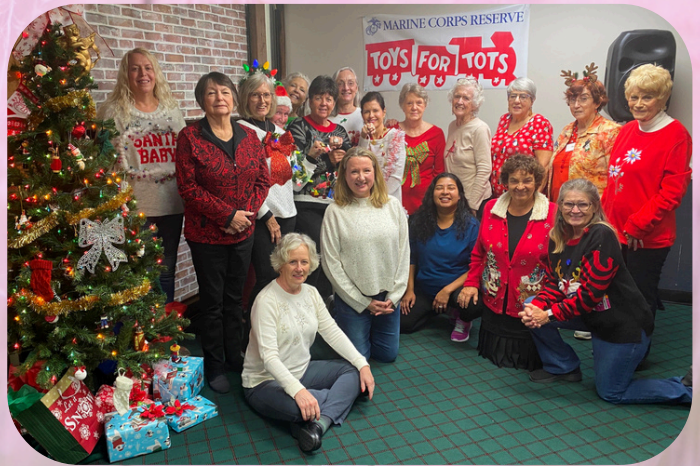
The Garden Club gets ready to do its Dirty Santa.