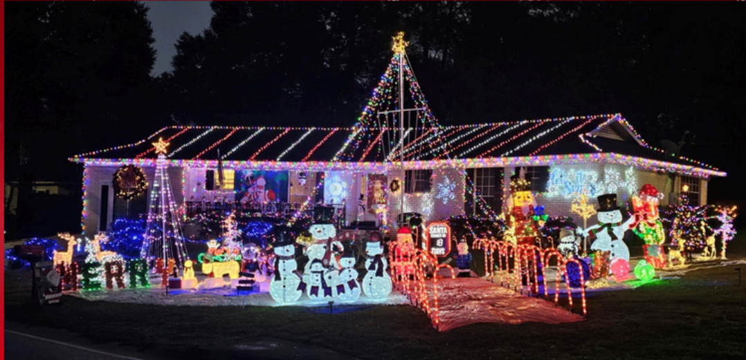
FIRST PLACE - 186 RIDGEWOOD DR