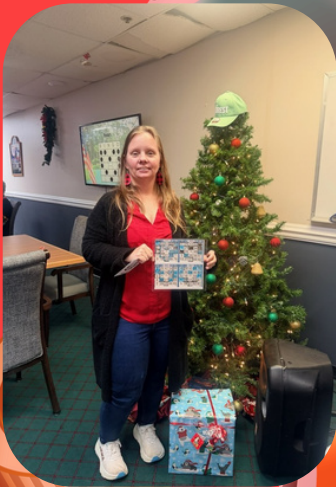
Game 5, Misty