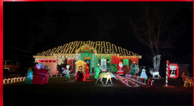
THIRD PLACE 114 LAWSON RD