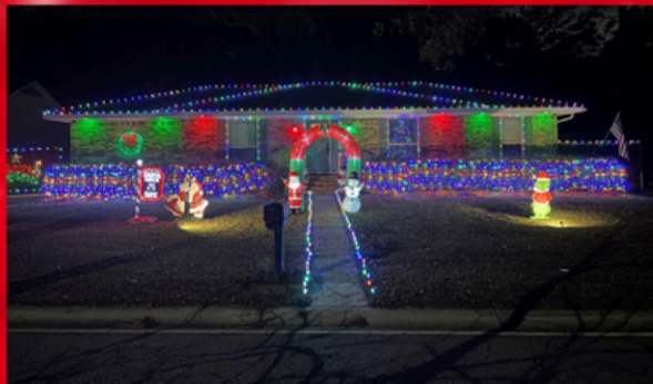
SECOND PLACE 160 RIDGEWOOD DR