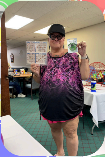
Game 1, Alli