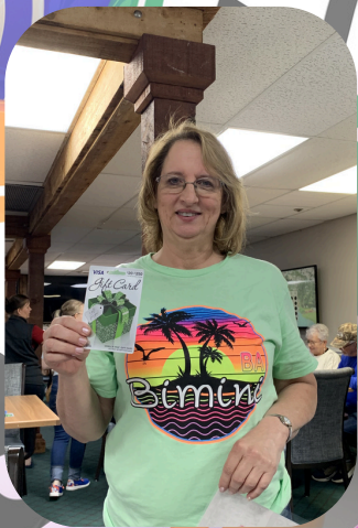
Game 5, Genie